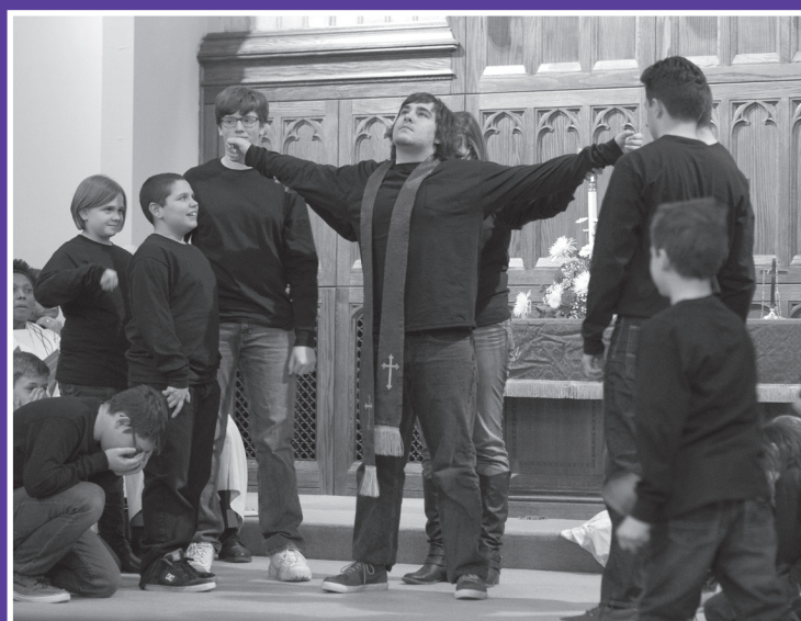
The youth of New Bethlehem Presbyterian Church (Beaver-Butler Presbytery) presented a drama, "The Life of Christ."