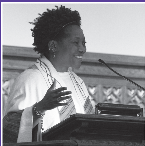
The preacher of the day was Rev. Karen Georgia Thompson, Minister of Ecumenical and Interfaith Relations of the United Church of Christ.