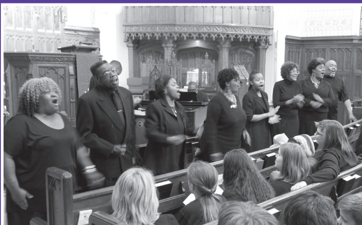
The New Light Temple Baptist Church choir offered a gospel prelude.