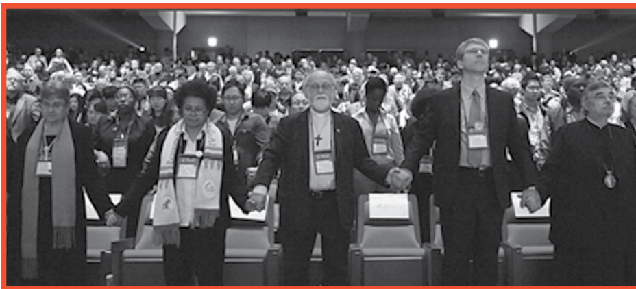
WCC assembly participants united in prayer